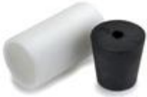
A868 - Sensor Dust Filter Prolong the life of your sensor