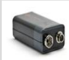
R007 - 9V Battery