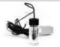
A340 - Glycol Bottle Bottle of Glycol Solution w/ Septum Close