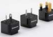
R066 – Universal Plug Kit International kit for Data Loggers