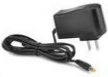
R180 – Replacement AC Adapter For TSB/TWE/TWP Loggers and the KT8/KT6 series