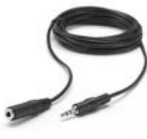
A062 – 10' Adapter Extension Cable Power Extension for R157 AC Adapter