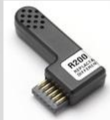
R200 – Replaceable Sensor Angled Temperature/Humidity Sensor